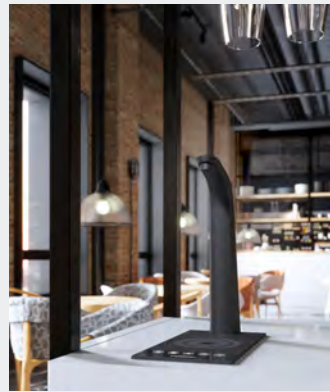
Borg & Overström